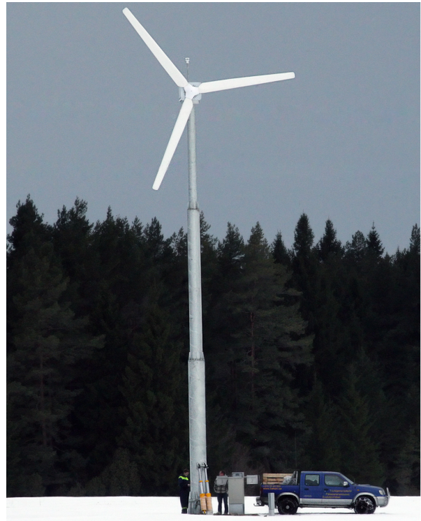
(10 kW võrgulahendusega elektrituulik Eestis 02.2012)